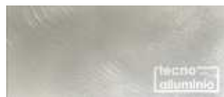
Electro 30 Light MATT