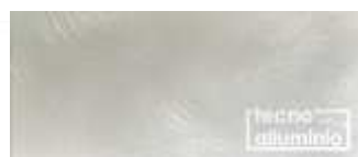
Electro 30 Light GLOSS