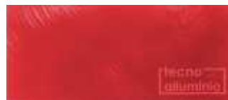
Red 50* MATT