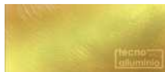
Gold 03 Medium GLOSS