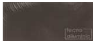
Electro 34 Medium MATT