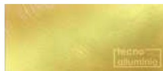
Gold 03 Medium MATT