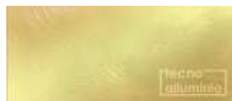
Gold 02 Light MATT