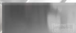
Titanium 64 Light GLOSS