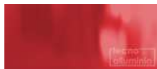
Red 50* MATT