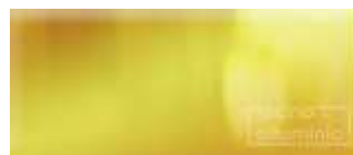
Gold 03 Medium GLOSS