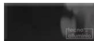
Electro 36 Dark GLOSS