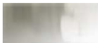
Electro 30 Light GLOSS