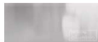
Stainless Steel 21 Dark* GLOSS