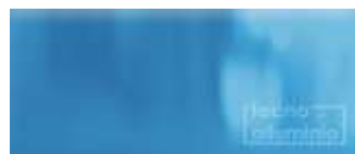
Blu 58 Bright GLOSS

The colours shown here are indicative. For exact colours, a sample should be requested.