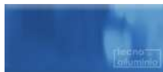
Blu 60 Dark GLOSS