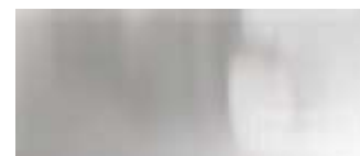
Silver 01 GLOSS