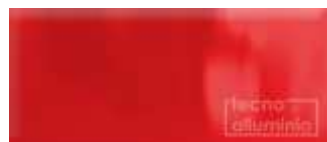
Red 50* GLOSS