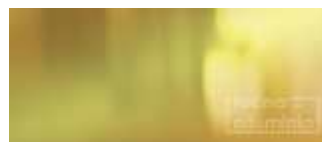
Gold 03 Medium MATT