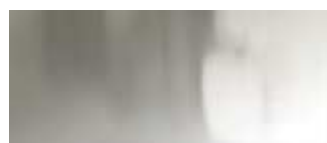
Electro 30 Light MATT