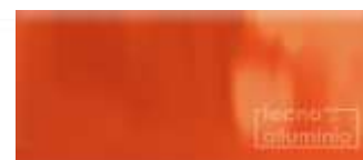
Orange 55* GLOSS